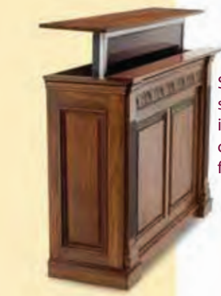
Single lift shown installed in a walnut cabinet with floating lid.